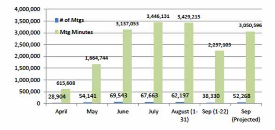
Figure 2. DCS Monthly Usage

After a cycle integration and testing, DCS was implemented in milCloud. DCS reached its full operational capability in June 2015, fully replacing DCO as the DoD cloud service offering. Figure 2 shows that DCS supports more than 60,000 monthly meetings, totaling more than 3 million meeting minutes.