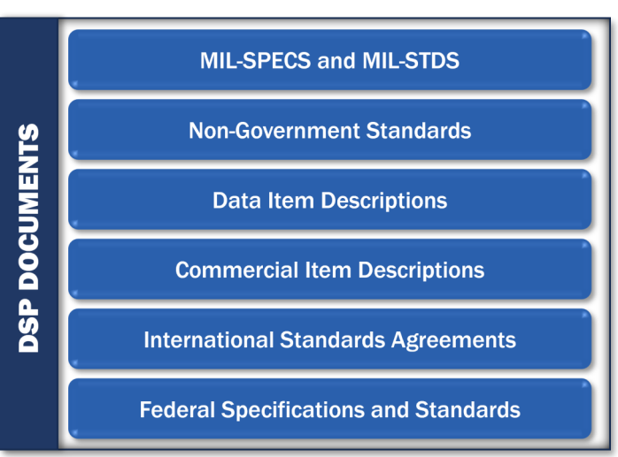
DSPO provides DoD standardization policy, procedures, tools, and training to standards users and more than 100 standardization management activities across the Department