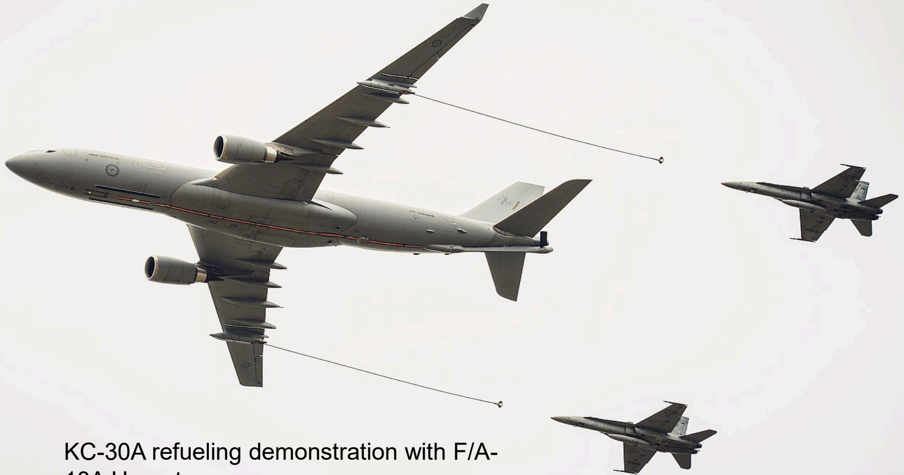
KC-30A refueling demonstration with F/A-18A Hornets