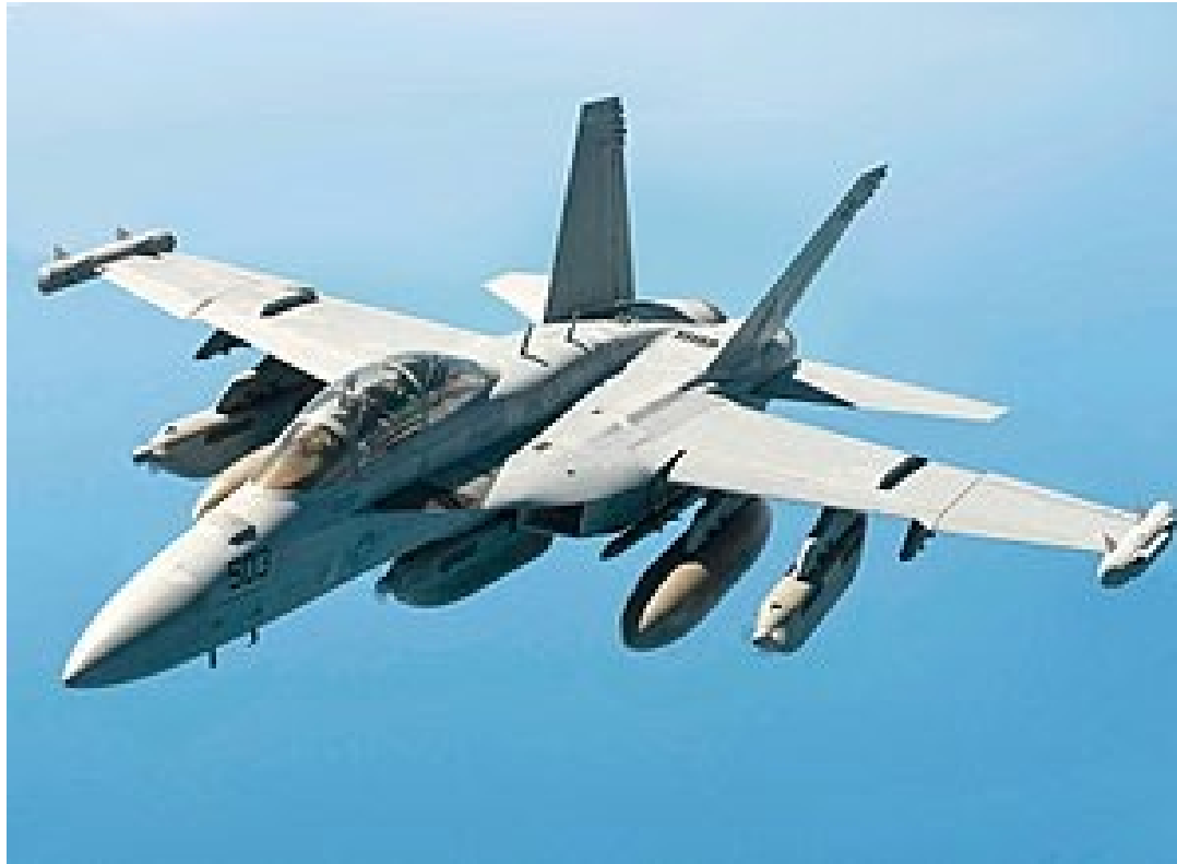
A U.S. Navy EA-18G in flight over the Pacific Ocean